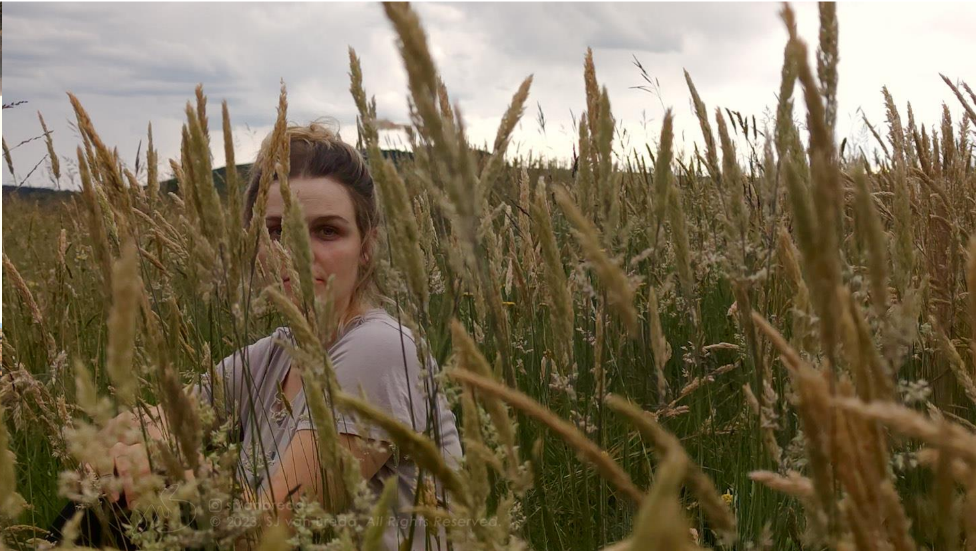
Sacred Wild is accompanied by an Independent film "Freeflow" by SJ van Brede