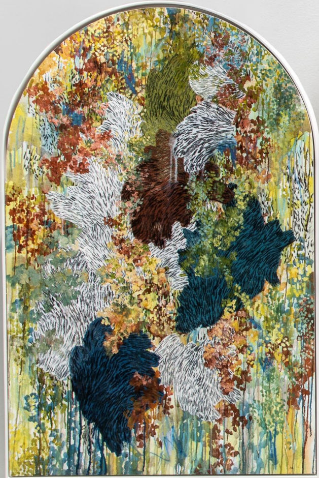
Riverside Shopping Center, Bryanston, Johannesburg