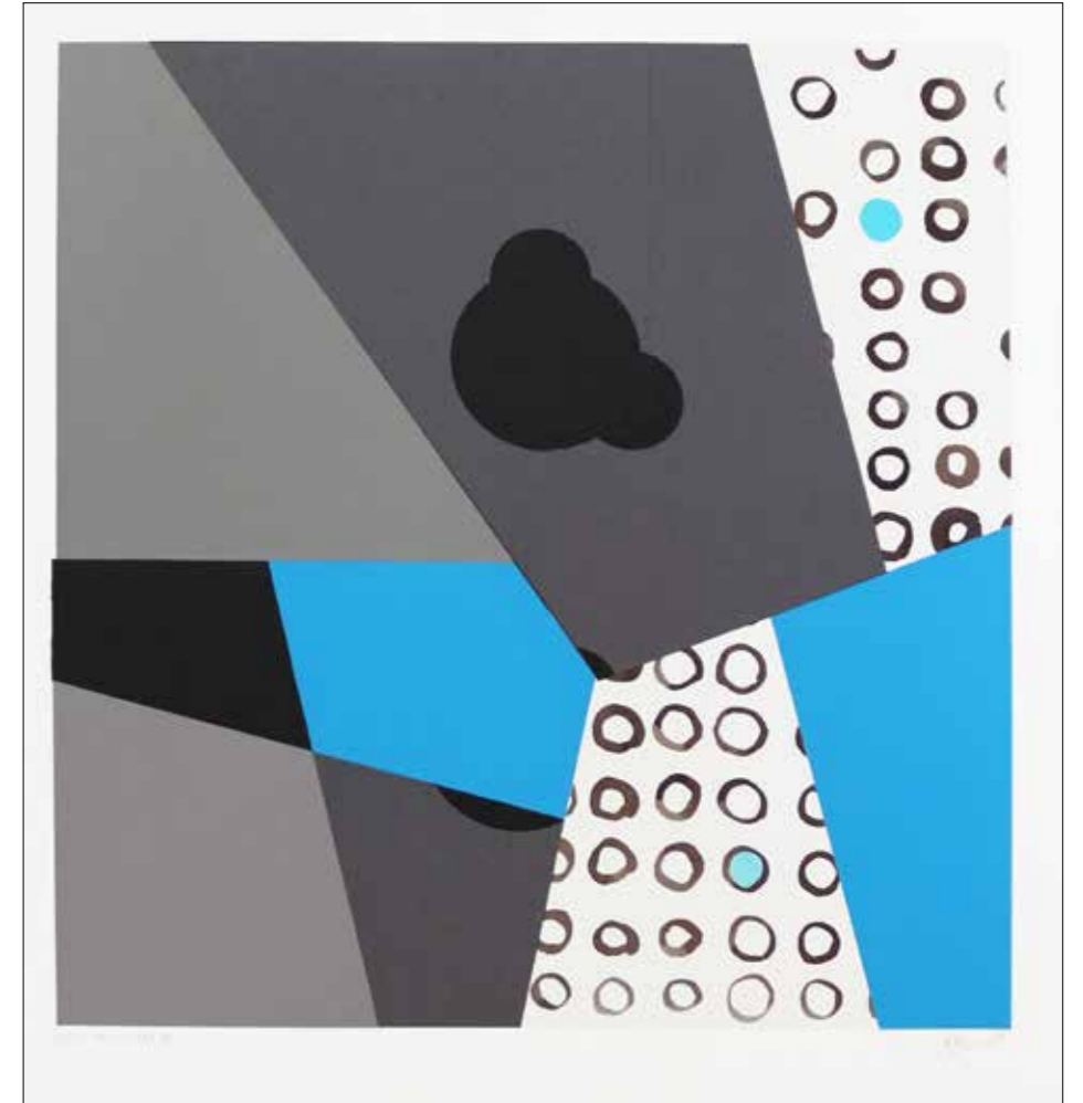
Follicular 3 50 x 46cm 2019 ..... Watercolour ink on Fine Art papers and Fabriano Unica 250gsm