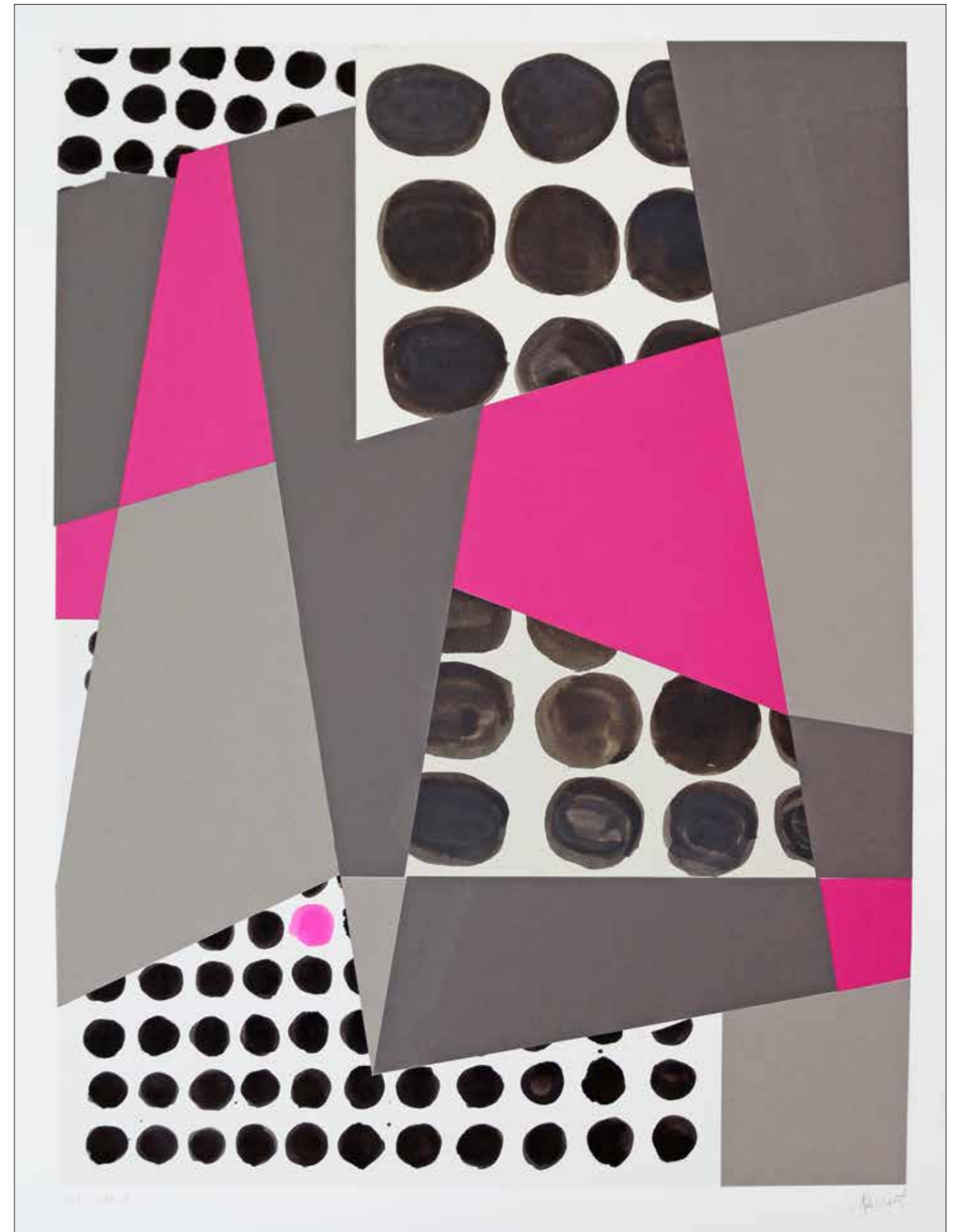
Luteal 2 68,5 x 50cm 2019

Watercolour ink on Fine Art papers and Fabriano Unica 250gsm