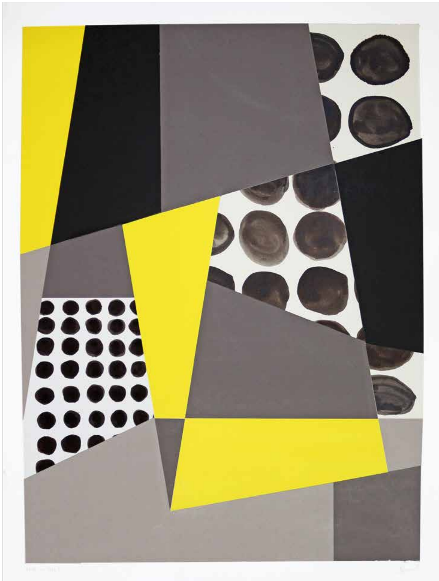
Luteal 1 68,5 x 50cm 2019

Watercolour ink on Fine Art papers and Fabriano Unica 250gsm