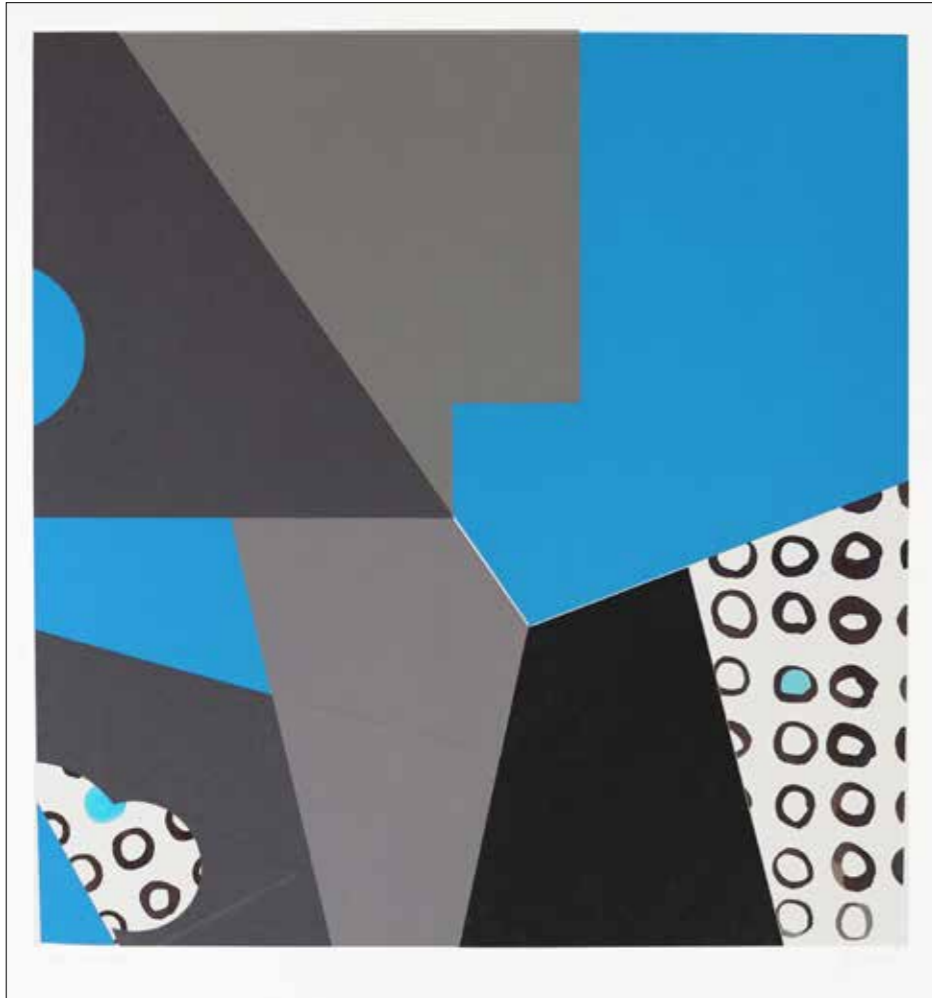
Follicular 1 50 x 46cm 2019 ..... Watercolour ink on Fine Art papers and Fabriano Unica 250gsm