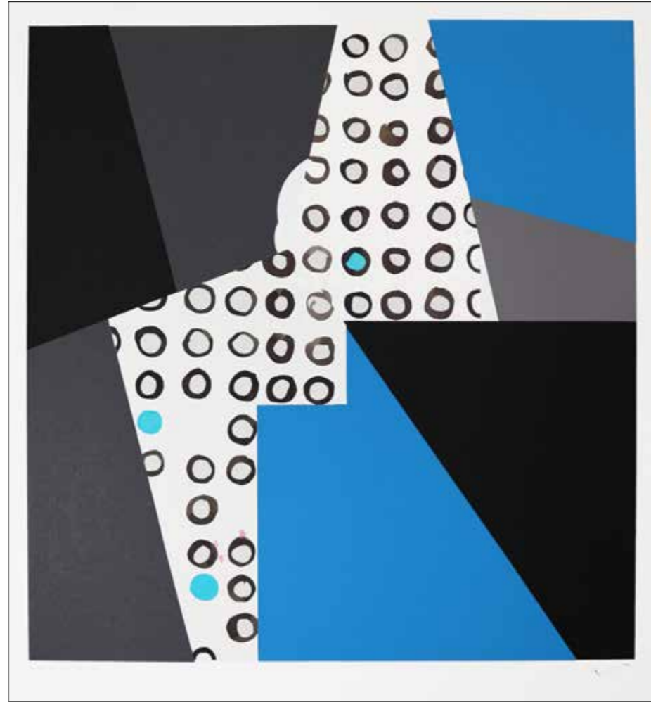
Follicular 2 50 x 46cm 2019 ..... Watercolour ink on Fine Art papers and Fabriano Unica 250gsm